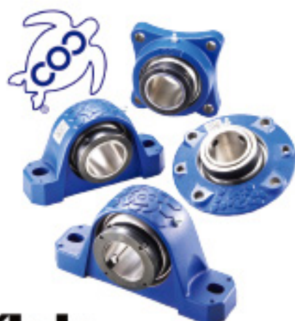
Spherical Roller Bearing Units