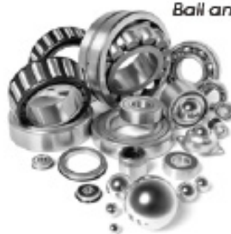
Ball and Roller Bearings