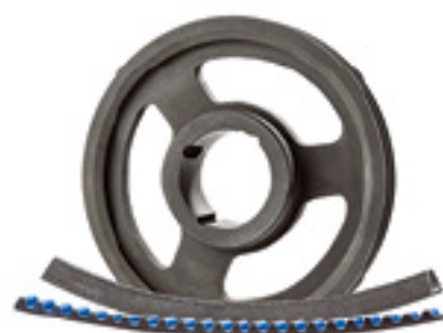
Belts and Pulleys