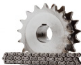
Chains and Sprockets