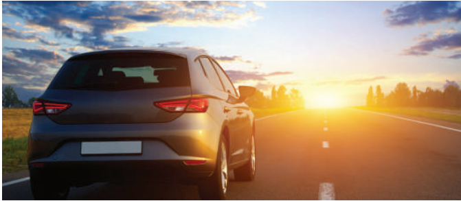
Passenger Cars & Light Vehicles