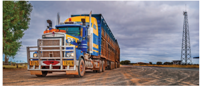
Heavy Duty Transport