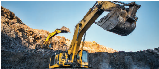
Mining and Civil Construction