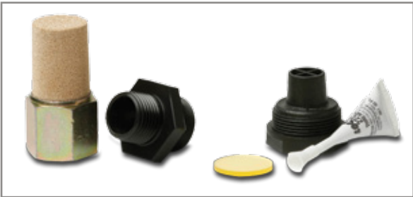
Cap repair kits are available for all sizes.