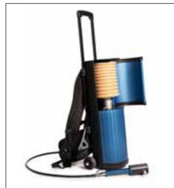
Battery operated - no cables necessary