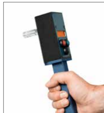
Easy to operate through the remote control unit build into the handle