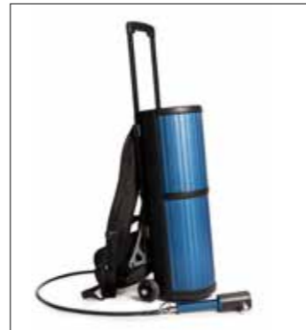
Fully transportable through either carrying harness or build in wheel set