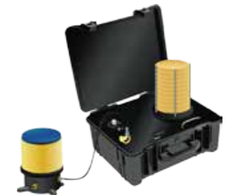
Refilling of central lubrication system reservoir using Hove Refiller.

Hove Refiller is operated manually, direct from the pump or by means of a remote control.